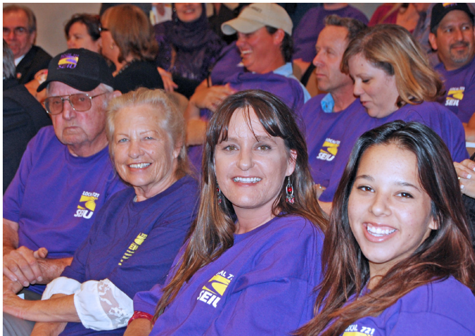
Simi Valley members convinced the City Council to reconsider its bargaining offer.

Congratulations to our Santa Ana members.