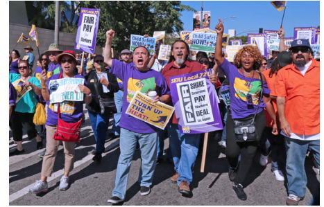
About 5,000 LA County Members attended the historic rally on October 1.