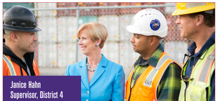
Janice Hahn Supervisor, District 4

Members living in L.A. County have an opportunity to elect two more pro-worker voices to the L.A. Board of Supervisors. We can ensure our county is led by officials who understand the importance of reforming caseloads, reducing high attrition rates and creating a safe and just culture in the workplace.