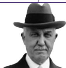
MELLON-SCAIFE FAMILY FOUNDATION

T he Freedom Foundation, a nonprofit funded by a network of ultra-conservative billionaires who want to eliminate workers' ability to organize unions, is readying an assault on members of SEIU 721 and other West Coast public sector unions as soon as the Supreme Court hands down a decision in Janus v. AFSCME .