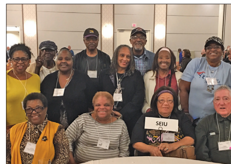
Several members of the SEIU 721 Retirees Committee attended the ARA Membership Meeting.