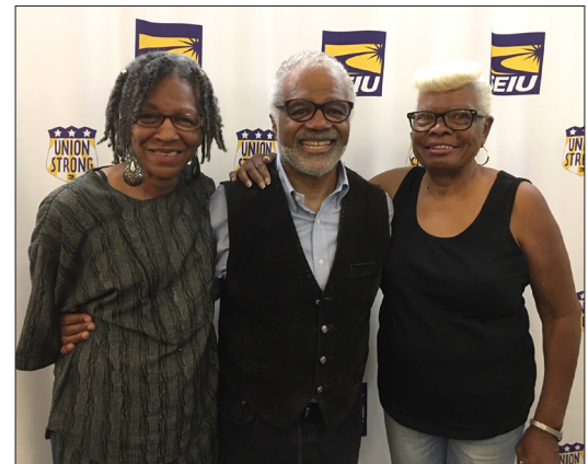
At left and above, committee members greet actor Ted Lange, who made a presentation at the June 2019 monthly meeting.