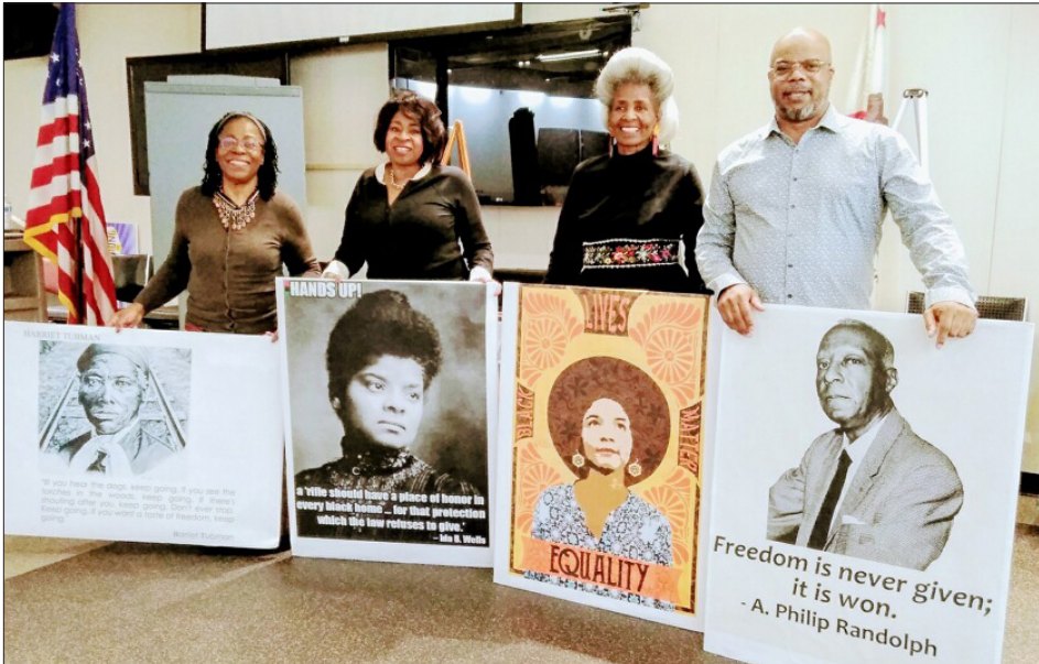
Above, committee members shared information on Harriet Tubman, Ida B. Wells-Barnett, Angela Davis and A. Phillip Randolph during Black History Month in Feb. 2019.

721 retirees are committed to uplifting, educating and working for the betterment of all members in every way that they can. Here are scenes of members' activities in 2019.