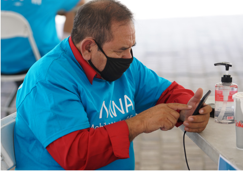
MWA member texts voters urging them to vote No on Prop 22.