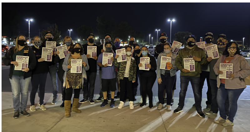
SEIU 721 City of Hemet members call out the misuse of Measure U funds.

This year, due to the pandemic, SEIU 721 was unable to host in-person benefits fairs at LA County worksites, so we reconfigured them to a virtual format.