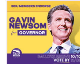
Gavin Newsom Governor