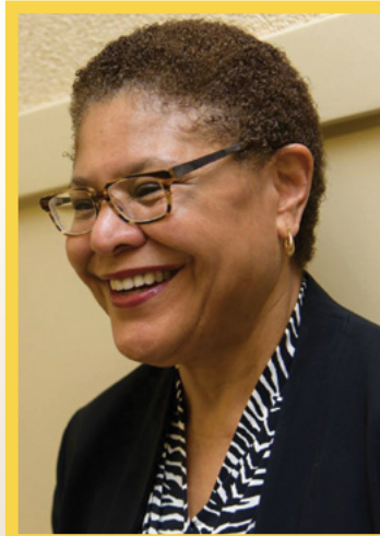
Karen Bass Mayor