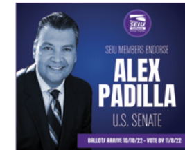
Alex Padilla U.S. Senate