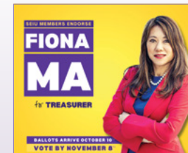
Fiona Ma Treasurer