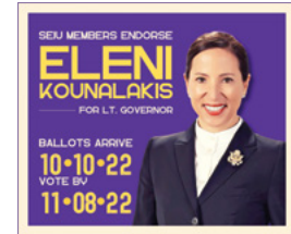
Eleni Kounalakis Lt. Governor