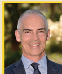
Mitch O'Farrell City Council District 13