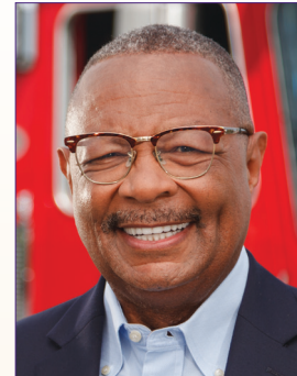
Reggie Jones-Sawyer LA City Council 10th District