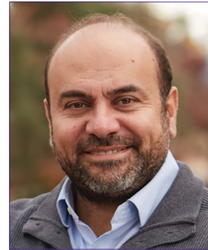
Adrin Nazarian for LA City Council 2nd District