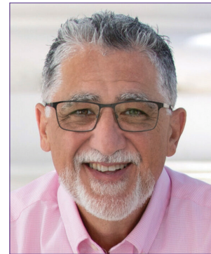
Anthony Portantino for U.S. Congress 30th District