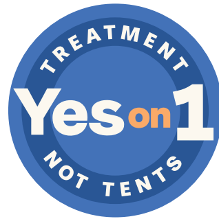
Yes on Proposition 1 Mental health services and bond measure

Ad paid for by Service Employees International Union Local 721 CTW, CLC Workers' Strength Committee sponsored by Service Employees International Unions 1545 Wilshire Blvd., Suite 300, Los Angeles. Not authorized by or coordinated with a City candidate or a committee controlled by a candidate. Additional information is available at ethics.lacity.org .