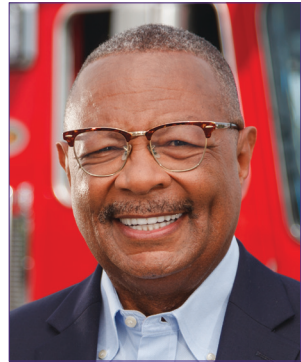
Reggie Jones-Sawyer for LA City Council 10th District