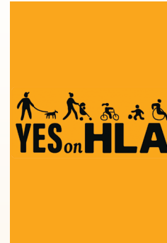
Yes on Measure HLA