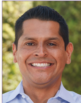
Miguel Santiago LA City Council 14th District