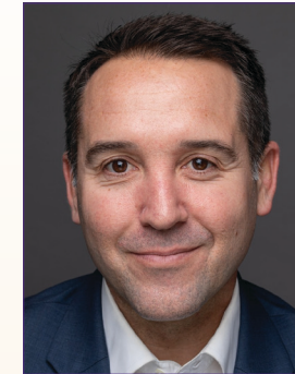
Matt LaVere Ventura County Board of Supervisors, District 1