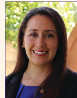
Vianey Lopez Ventura County Board of Supervisors, District 5