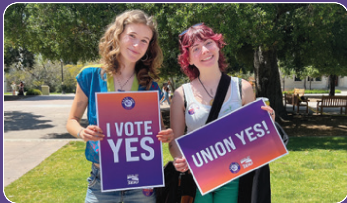
Occidental College student workers are voting to form their union with SEIU 721. Votes will be tallied on June 12.