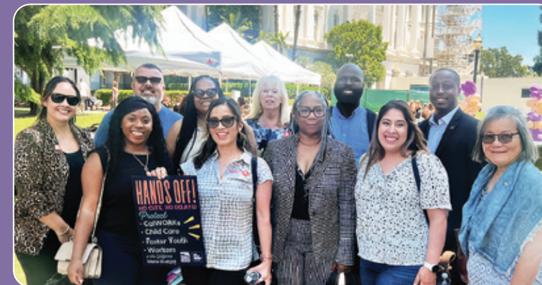
SEIU 721 members and staff met with legislators to lobby against cuts to CalWORKs, child care and foster youth services.