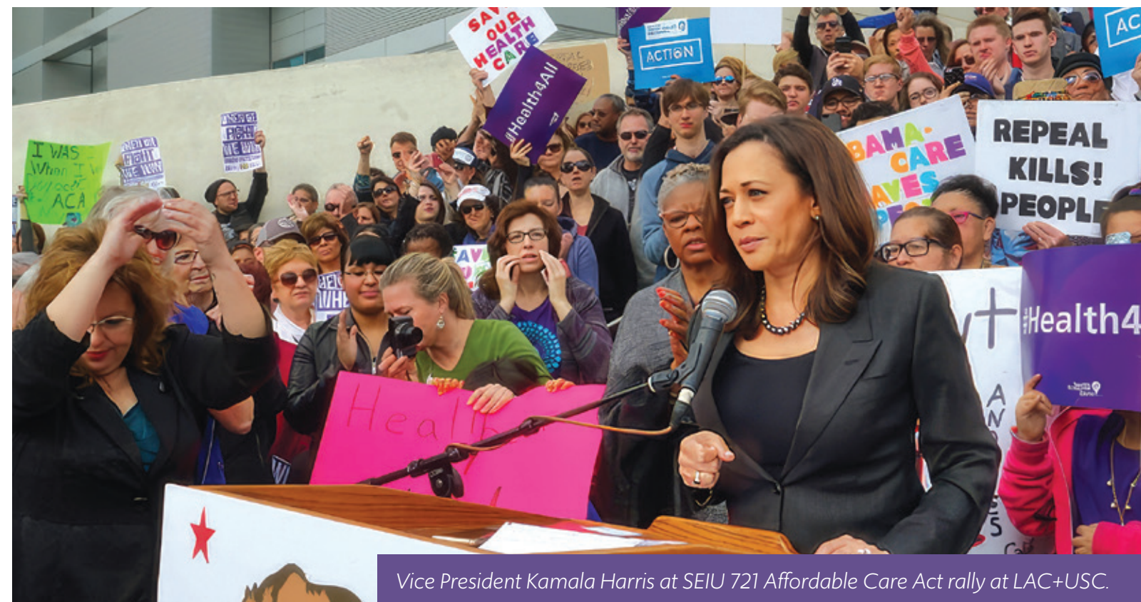
Vice President Kamala Harris at SEIU 721 Affordable Care Act rally at LAC+USC.